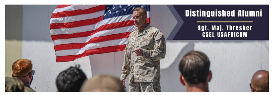
View SgtMaj Thresher's full story on the JKO public website at www.jcs.mil/jko